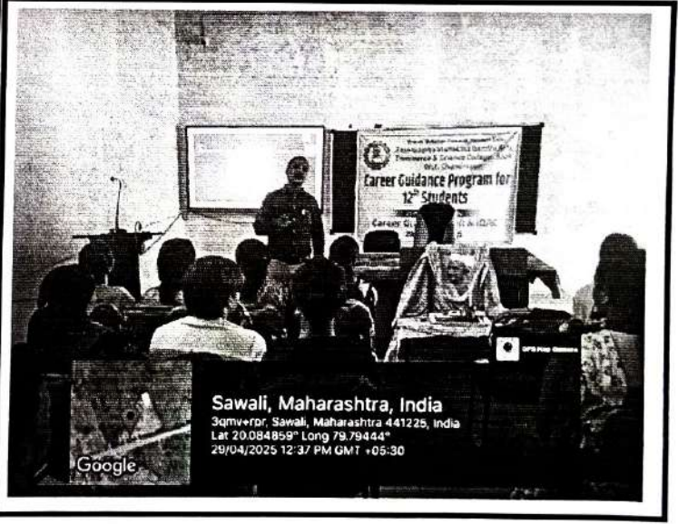
Experts interacting with the students