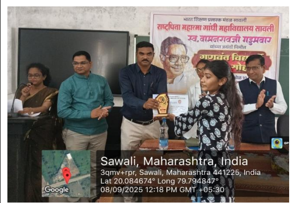
Felicitation of the Student for Academic Excellence