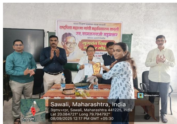
Felicitation of Student (Academic Excellence)