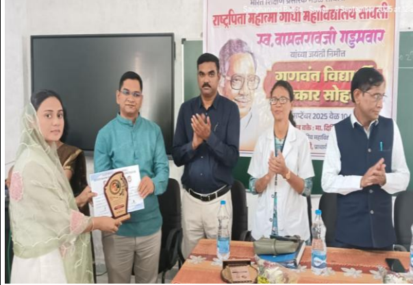
Felicitation of Student (Academic Excellence)