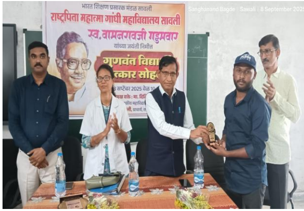
Felicitation of Student (Academic Excellence)