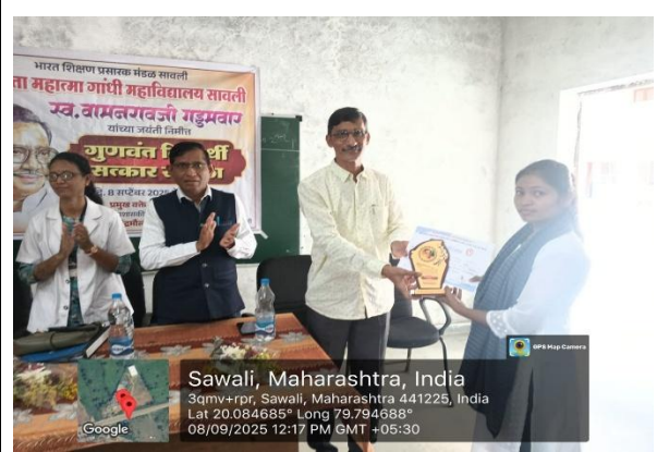
Felicitation of Student (Academic Excellence)