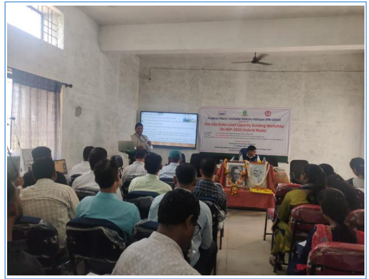
Participants engaging in the Q&A session during the workshop.